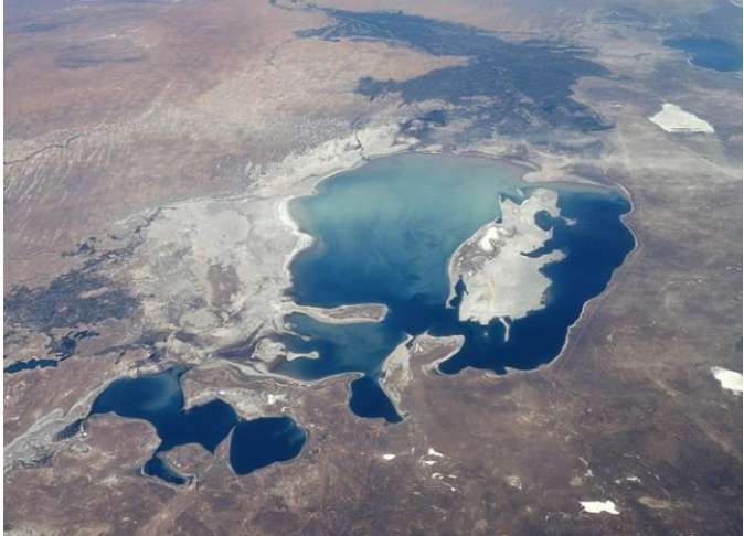
The Aral Sea from space in 1985 and 1997.